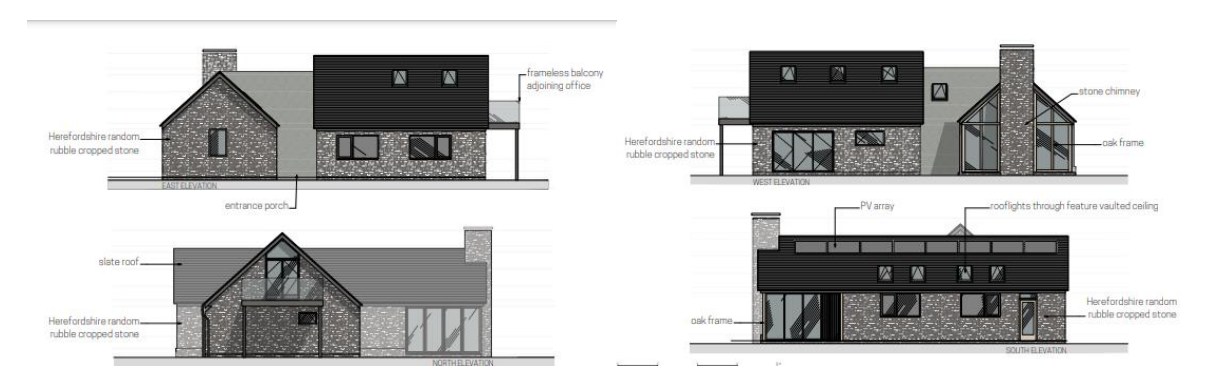
Proposed Elevations: Drawing Number 1933300

6.16 The dwelling proposed would be of generally single storey with roof space for office, bathroom and storage provision. The building would comprise two adjoining elements linked by structure housing staircase to the roof space. This would be constructed of painted render, local stone and weatherboard elements, which would not be seen as out of keeping in the locale given the mix of traditional materials. Given the nature of the site and existing hedgerow boundaries, the dwelling would have minimal visual impact using low discreet positioning. Noting the 1 and a half storey nature of the proposed and the relationship with neighbouring dwellings, issues of overshadowing are not anticipated. The proposed garage would be in keeping with the edge of village character, reading as an ancillary structure to the host dwelling. Extracts of the proposed plans are inserted below.